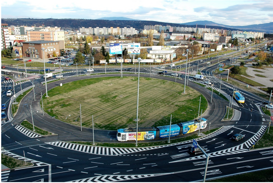
Kosice - Modavska