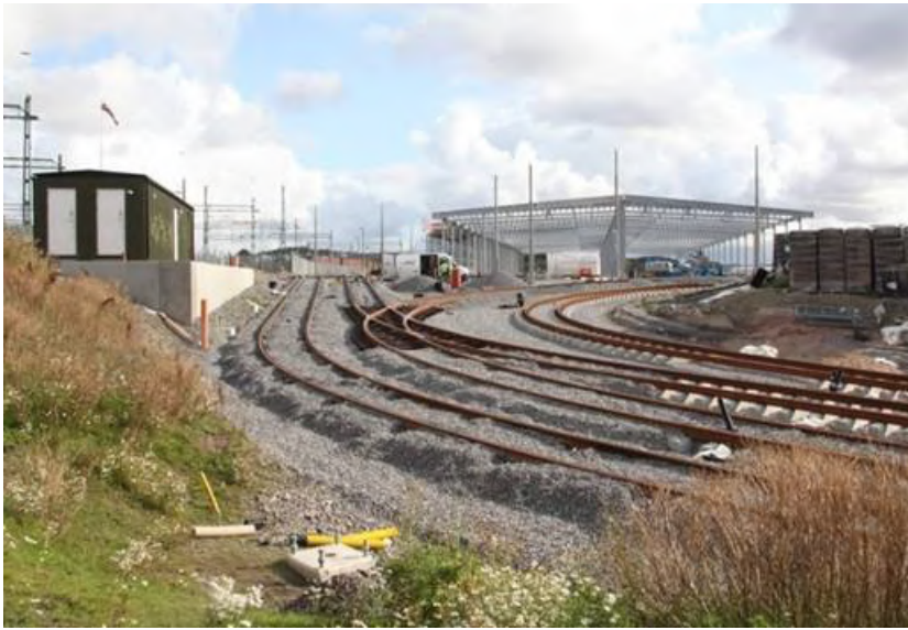
Göteborg - Ringön Depot