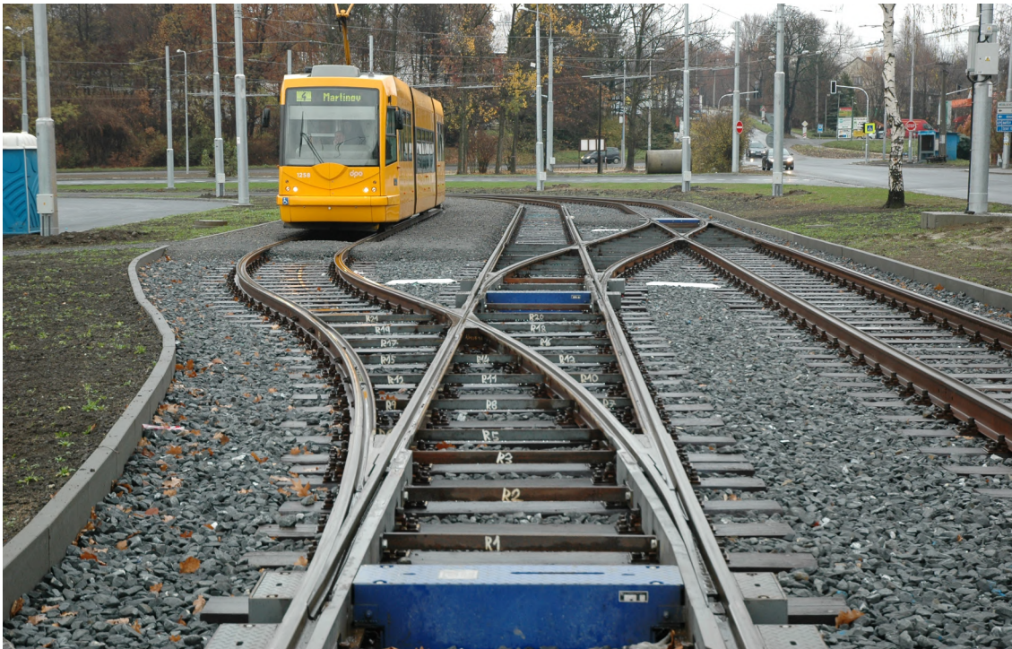
Ostrava - Hranecnik